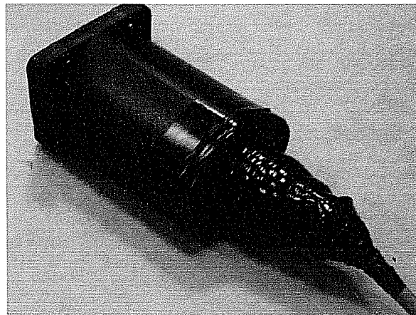
Figure 2 Super 88 2nd Layer